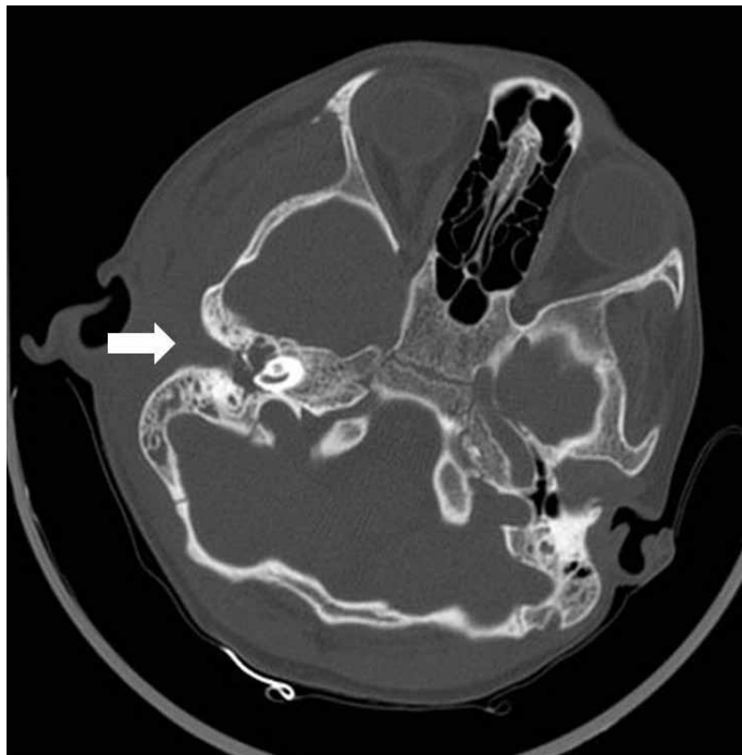
Figure 1. A CT scan of temporal bone: Soft tissue density completely filling the right external ear canal, middle ear, and mastoid bone (white arrow), and marked edema in the right masticator and buccal space.

CT examination revealed soft tissue density completely filling the right external auditory canal, middle ear, and mastoid bone along with marked edema in the right masticator and buccal space (Figure 1). There were no pathological findings in the paranasal sinuses. Cranial MRI revealed a 38x5-mm contrast enhancement of the loculated collection extending from the right external auditory canal anteriorly to the vicinity of the temporomandibular joint and edema in the right pterygoid muscles (Figure 2).