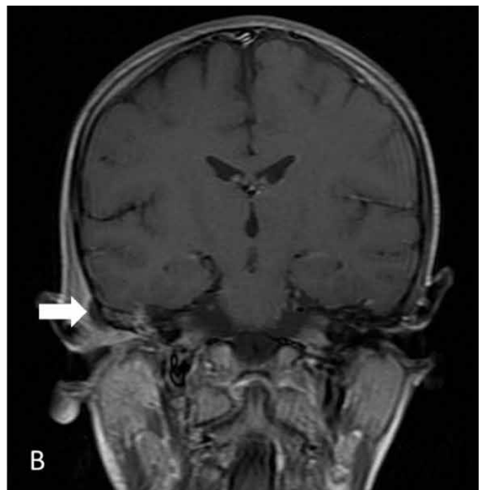
Figure 2. a, b. (a) Axial T2-weighted, (b) post-contrast coronal T1-weighted scan of cranial MRI. Abscess formation extending from the right external ear canal anteriorly to the vicinity of the temporomandibular joint (white arrows).