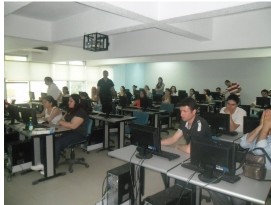
Figure 4. A view from training

Third week; studies given during second week was shown in practice by the participants selected randomly. Application cannot be performed by participants were completed with the guidance of researchers.