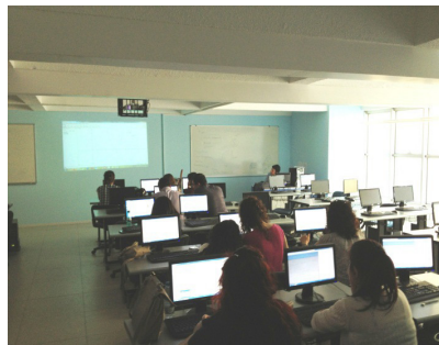
Figure 3. A view from training

In order to measure qualifications and attitudes of participants on applying techno-pedagogical knowledge in their mathematics courses, Computer Aided Mathematics Teaching Questionnaire was applied. Then 9 hours training is carried in three weeks as 3 hours per week on use of Geogebra application software which is one of utility programs to integrate technology to the course by a mathematics teacher. This training is carried in computer laboratory of Education Faculty of Aegean University allocating a computer to each participant (Figure 3). During training, guidance is provided for participants but abstained from information transfer. Opportunity is granted to participants to discover Geogebra.