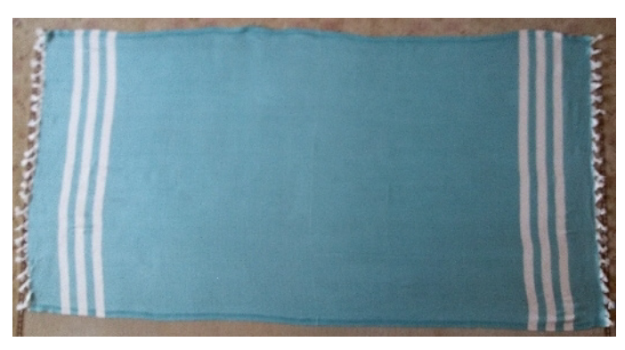
Picture 1. Simple "peshtamal" which was used in dress production for Kizilcaboluk Fest collection

The simple "peshtamal" whish was used in dress production for Kizilcaboluk Fest collection was demonstrated in Picture 1. This product is made from %100 bamboo yarn. Mostly Kizilcaboluk "peshtamal's" are produced from natural yarns which consists of more than %70 cotton fibre and some of them in small amount may contain polyester ore viscose fibre.