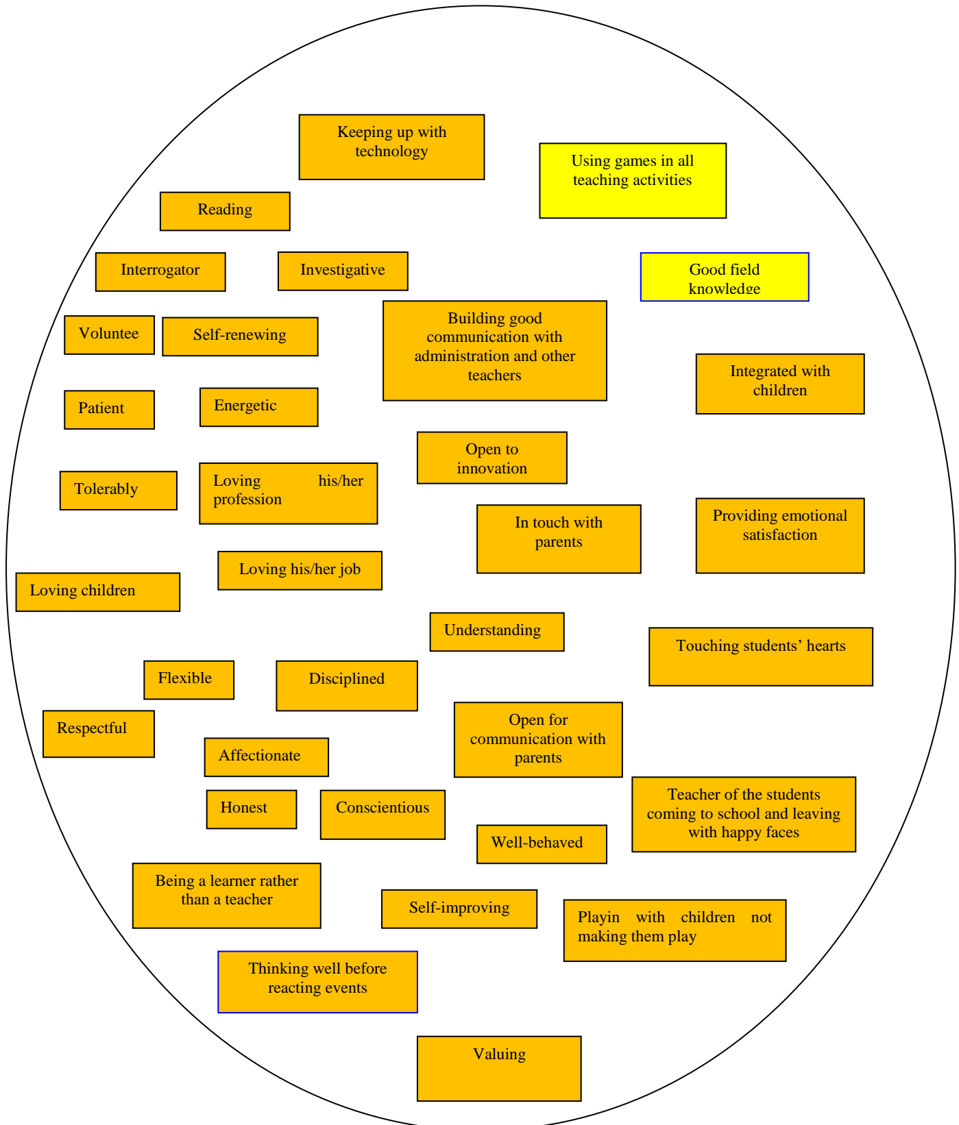
Figure 1. The codes regarding the definitions of quality/good teachers