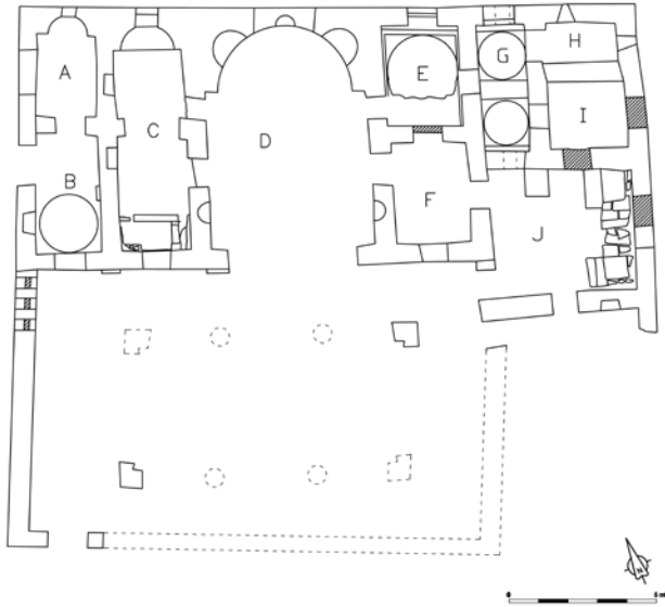
Fig. 2 Plan of the Building with Mosaics. Plan by G. Hamamcıoğlu - M. & G.K. Öztaşkın.

in the Building, requires further attention to be paid thereto. However, in order to understand the chronology associated with the Byzantine period at the city of Olympos, there is need for further attention to be paid to the Building. During the studies, the striking resemblance between the Building and the Roman baths with respect to their plans caused the idea that long before there might have been a bath structure around here 7 . Probably, at the Byzantine period, the previous plan was partially repeated during the re-construction of the Building. The second construction added a stairway to going up to the second floor and demarcated some of the large rooms at the first floor with walls.