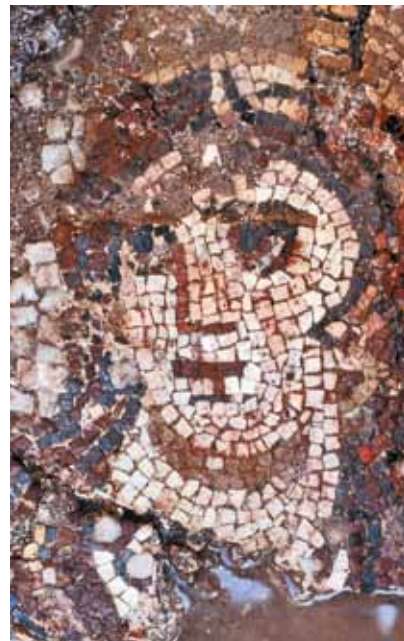
Fig. 4 Detail of Thalassa mosaic.

year 2009, when the mosaics in the Building were examined, both the fact that the woman figure was depicted nude and also its position inside the Building prompted the idea that possibly a pavement, one that belongs to the first stage of the Building, used to be thereat.