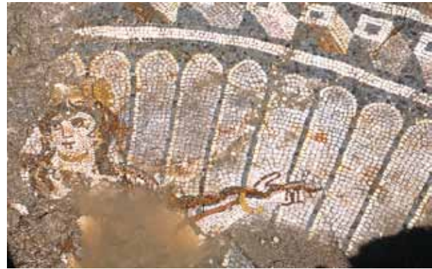
Fig. 3 Thalassa mosaic in Room D.