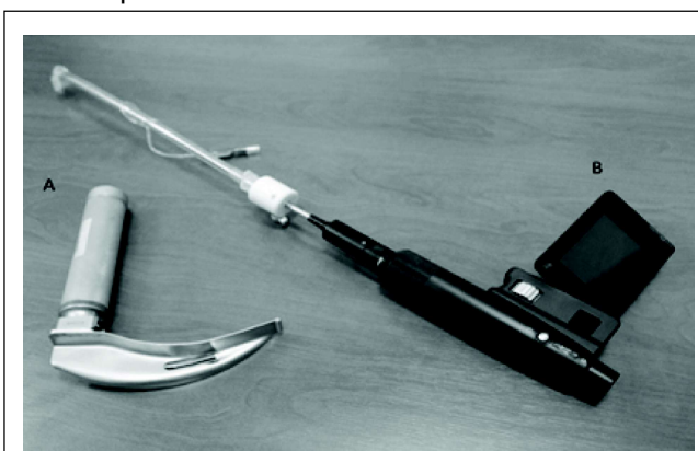
Figure-1: Macintosh laryngoscope (A) and Clarus optical stylet (B).

Of the 119 students approached, 94(79%) had never conducted ETI and were thus enrolled. Of them, 60(63.8%) were female. The overall mean age was 24.38\pm 0.94 years. Of the total, 92(97.8%) ETIs performed with the optical stylet were successful in the first attempt, and 2(2.2%) in