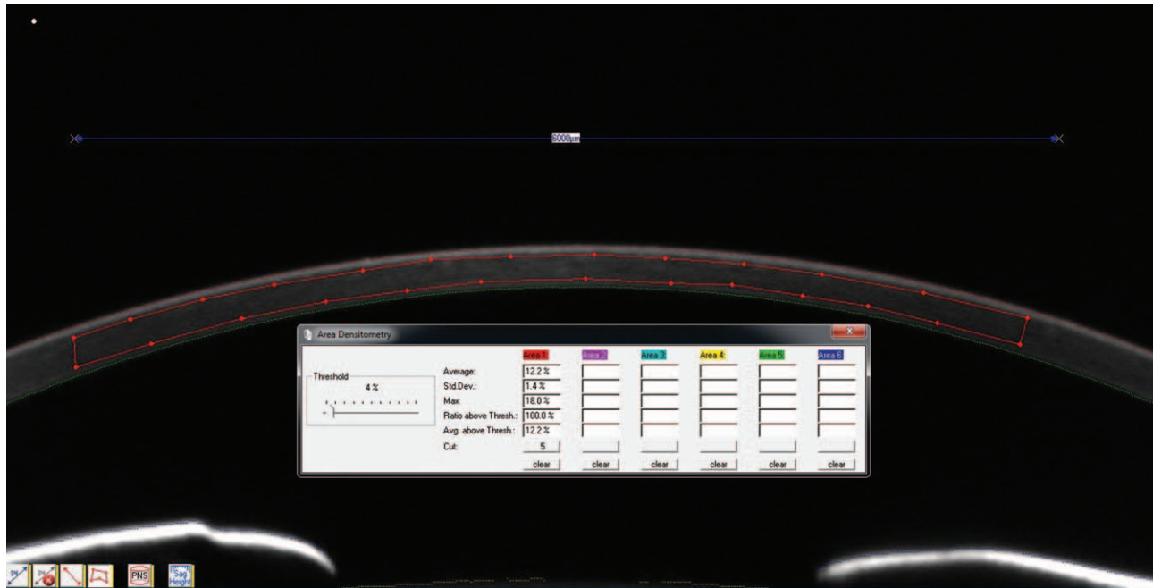
Figure 3. Areal corneal densitometric measurement screen of Pentacam HR.

were thicker than control group. This difference was found significant at all distances ( P = .009, P = .004, P = .039, P = .019, P = .005 respectively).