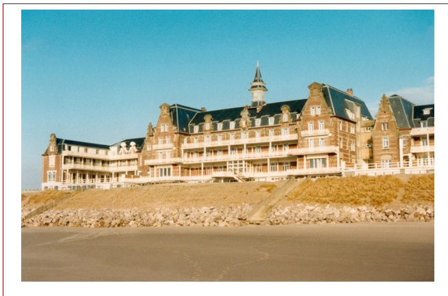
Figure-1. The Maritime Hospital of Berck