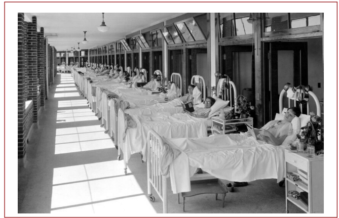
Figure-2. Ward for patients with tuberculosis

As a philosophy, he accepted that it was not important to deal with local involvements of the skeletal system, and tuberculosis should be accepted as a systemic disease for the treatment approach. To this end, he immobilized patients for a long time, with very strict hygienic conditions and plenty of sun (Figure-2).