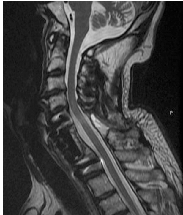
Figure 2. Axial sections of the level of C6 vertebra revealed numerous T1-hypointense, T2-hyperintense cystic lesions located in both laminae and spinous process which do not show contrast enhancement after contrast administration and the biggest one was at the level of right-lamina, 12x7 mm in size and expansile, also some cysts had septa. Especially the posterolateral parts of spinal cord seems pressed by the defined cystic lesions.