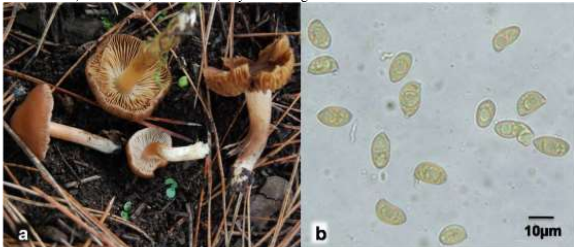
Figure 3. Inocybe quietiodor : a- basidiocarps, b- spores.

Afyonkarahisar, Sandıklı, Örencik village, Çivril ways to 1 st km, Bölükçam location, it grows in the pine areas, 38°26.70N-29°53.52E, 1190 ± 10m, 30.11.2008, Afyon and Yağız 2597.