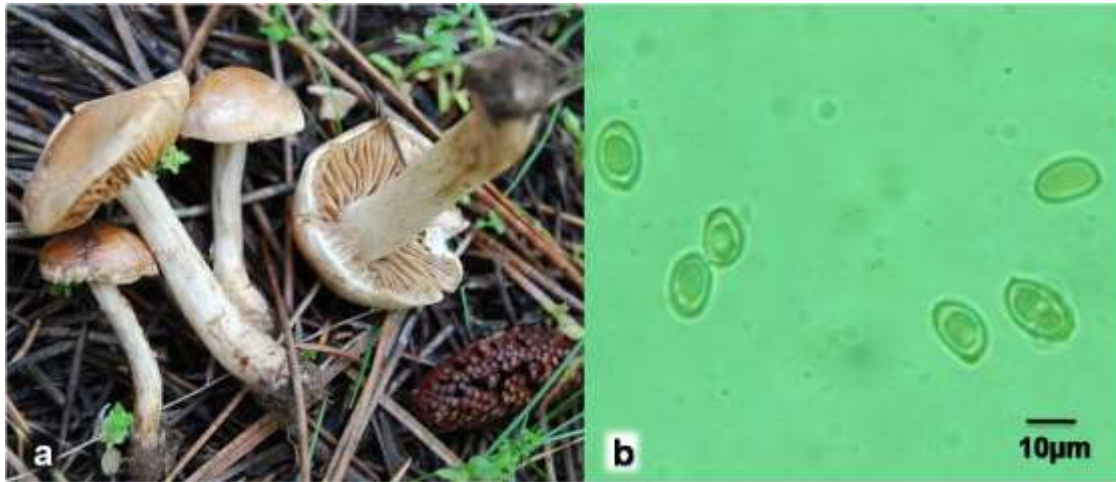
Figure 2. Inocybe inconcinna : a- basidiocarps, b- spores