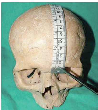
Figure 1. Antero-posterior view of nasion-coronal suture distance