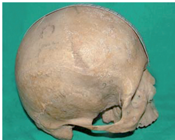
Figure 2. Lateral view of nasion-coronal suture distance