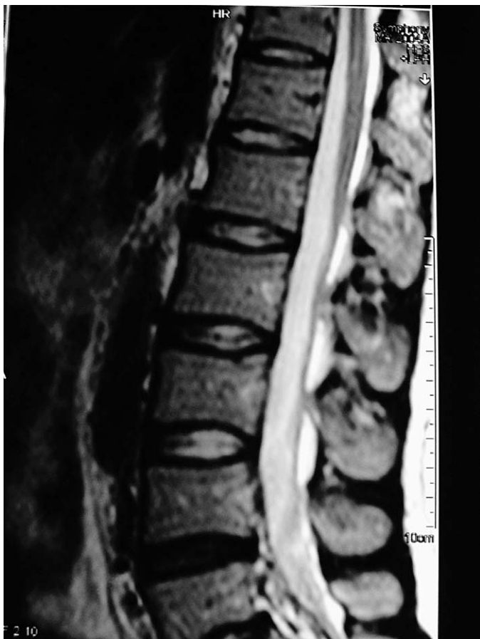
Figure 2. Follow-up spinal magnetic resonance image showing resolution, taken 1 year later when symptoms had resolved.

Acute transverse myelitis may be an isolated entity or may occur in the context of a multifocal or even a multisystemic disease (12). In this case, 2 different factors (Behçet's disease and vaccination) may explain the etiology of ATM. Carod-Artal et al (13) and Olson et al (14) reported cases with myelopathy at the level of the conus medullaris due to Schistosoma mansoni . Longitudinal involvement of the spinal cord including the conus medullaris level due to systemic lupus erythematosus-related transverse myelitis has been reported (15,16). However, it has not been reported with Behçet's disease or after rabies vaccination. Only one case with isolated myelitis of the conus medullaris due to vaccination against tetanus-poliomyelitis was reported by Abdennebi et al (4).