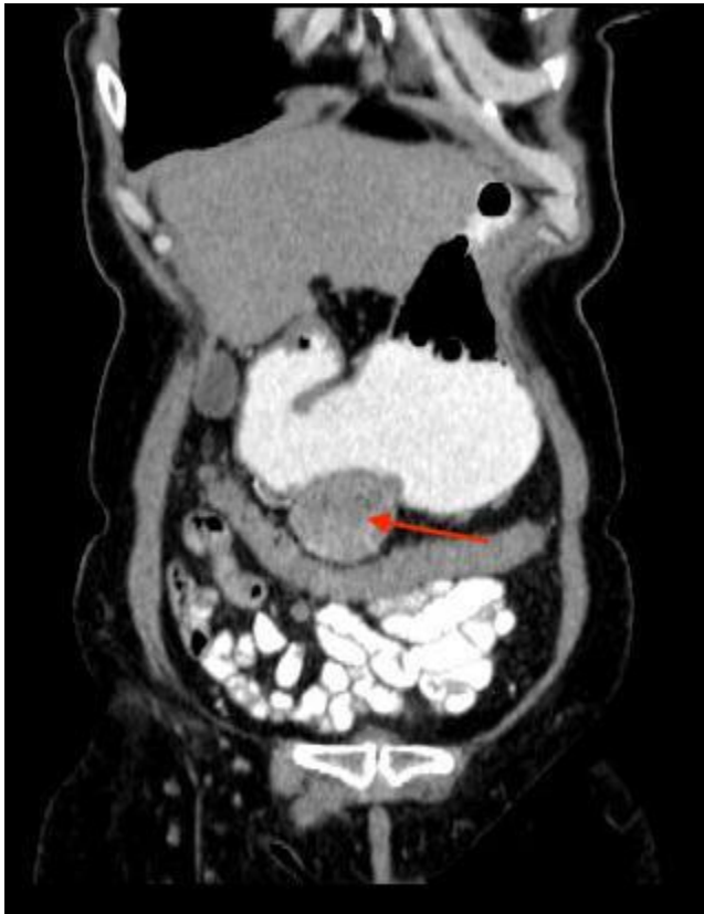
Figure 1 A: Coronal CT image of the mass (Red arrow).

gastrointestinal stromal tumor (GIST) of the stomach. One month later subtotal gastrectomy and omentectomy was performed as the histopathological examination of the previous specimen revealed positive surgical margin and the final report of the immunohistochemical examination was reported as LGESS with a diameter of 1.4cm and 18 reactive lymphadenopathy in total. Lymphovascular invasion of the tumor was detected. Yet, no perineural invasion was seen. Immunohistochemical examination of the tumor revealed estrogen receptor positivity (ER+), progesterone receptor positivity (PR+), Bcl-2 positivity. Patient was discharged without any problem on the 5th postoperative day. She was prescribed Megestrol acetate 160 mg (once a day). During 6 month-follow-up no sign of recurrence or metastasis was detected.