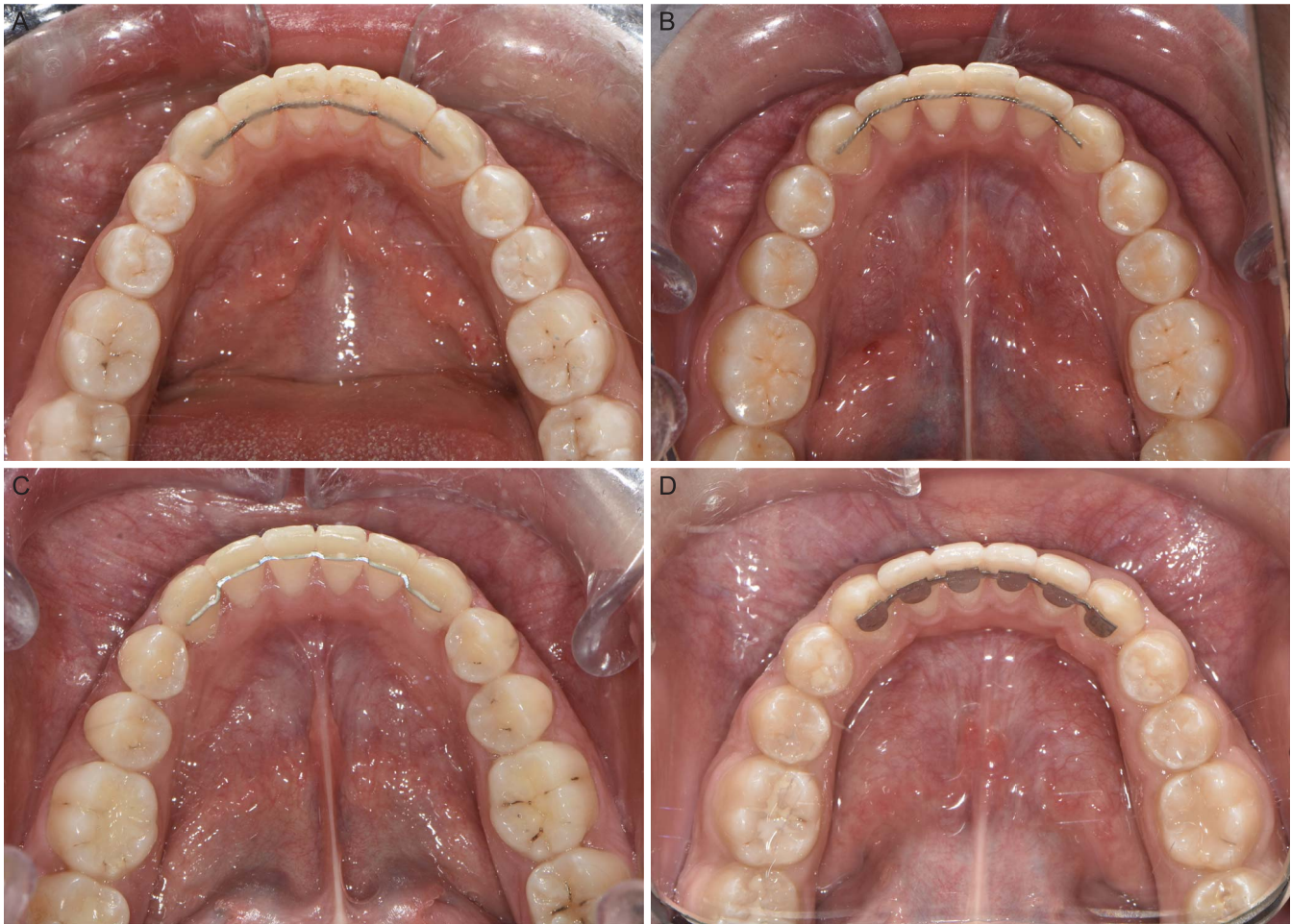
Figure 2. Retainers applied: (A) group 1 (dead-soft wire), (B) group 2 (5-strand stainless steel wire), (C) group 3 (Memotain), and (D) group 4 (connected bonding pads).

measurements were repeated on 44 randomly selected digital models to determine intraexaminer reliability 4 weeks later.