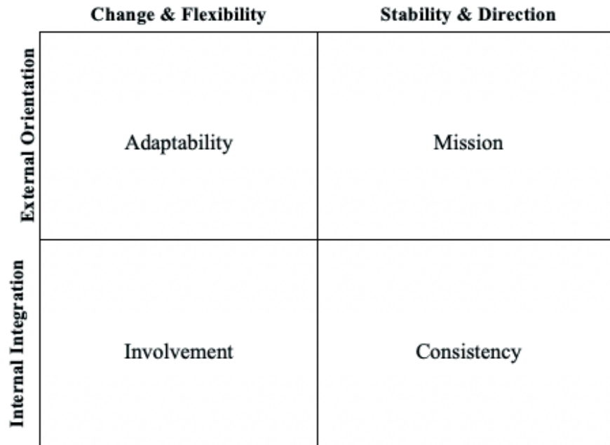
Figure 1: Theoretical model of organisational culture traits (Denison & Mishra, 1995)

Certain specific traits are highlighted in the Denison Model of Organisational Culture, and it is important for a firm master these for the purpose of working effectively. The illustration shows that the centre of the model includes 'Beliefs and Assumptions'. These include deeply held elements of the identity of an organisation, which are generally difficult to access (Roscoe et al., 2019). There are three indexes of each trait. For example, 'Adaptability' includes 'Creating Change', 'Organisational Learning', and 'Customer Focus'. Based on Denison's research, it has been found that in order to ensure high effectiveness, it is important to achieve high cultural scores in all traits. Hence, effective companies are those that have an adaptive, consistent culture and one that fosters high involvement. Moreover, effective organisations should focus on building a shared sense of mission (Erthal and Marques, 2018).