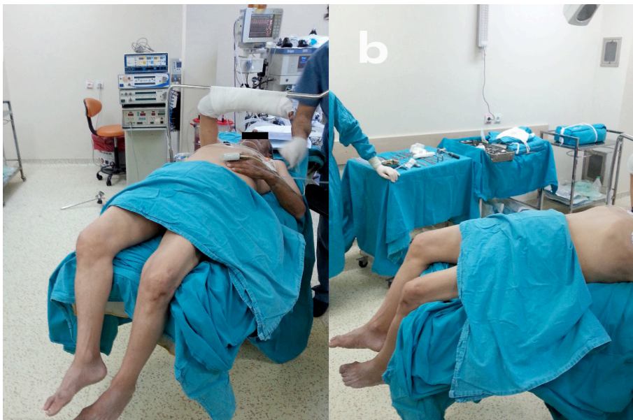
Figure 1. Positioning the patient in the supine position with the knees flexed