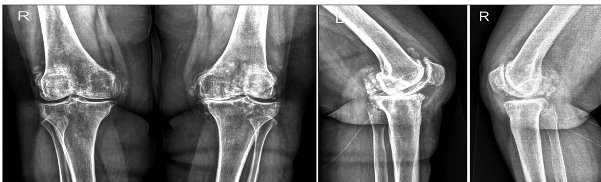
FIGURE 1: Postero-anterior and lateral X-rays of the knees demonstrating bilateral widespread multiple calcified loose bodies, joint space narrowing and osteoporosis.

Radiographs of the hand and knees and magnetic resonance imaging (MRI) examination of both knees were performed. In consistent with physical examination, bilateral hand radiographs revealed typical features of advanced RA; bilateral radiocarpal, intercarpal and carpometacarpal joint space narrowing, periarticular osteoporosis, demineralized carpal bones, erosions in carpal bones and styloid process of ulna. On the other hand, bilateral knee radiographs showed widespread multiple calcified loose bodies, joint space narrowing and osteoporosis as shown in Figure 1 . Moreover on bilateral knee