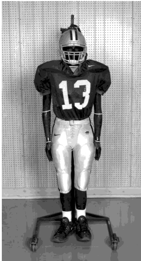
Picture 1. The thermal manikin at Kansas State University is dressed for the evaluation

A study for heat transfer off liquid cooling garment was done with a copper manikin, typical of which was its soft simulated skin – a newly thermoplastic elastomer material ( Yang et al ,2008).