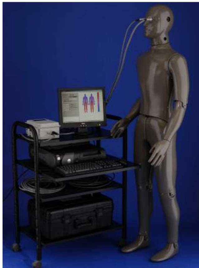
Picture 2. Newton thermal manikin (Measurement Technology Northwest, 2010)