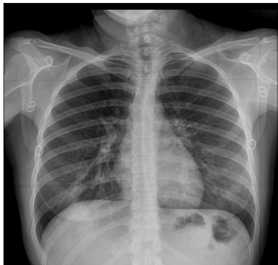
Figure 1. Postero-anterior chest X-ray was normal

maximum. The neutrophil count was 4440/\mu l in the hemogram taken at the 24th hour of G-CSF treatment. The last peripheral blood smear was also evaluated by hematologists. There was presence of neutrophils in peripheral smear but appeared fragile. There were hyposegmented (hypolobulated) or bilobed neutrophil nuclei as known as pseudo Pelger-Huet anomaly. Hypogranulation of cytoplasm was also noted. The cytoplasm of neutrophils was pale. All these were dysplasia findings of neutrophils (Figure 3).