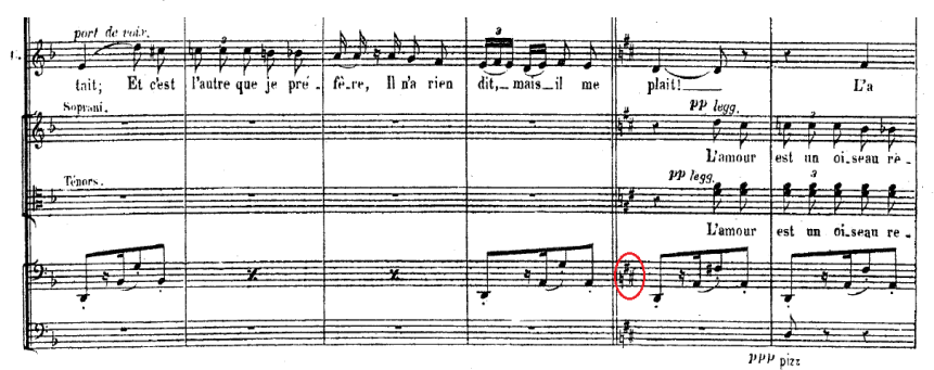
Figure 4. Carmen Opera Act 1, No.5, (p.80).

Furthermore, the cello's accompaniment with the consistent rhythmic figure persists even during tonal shifts within the composition, such as the transition from the key of D minor to D major.