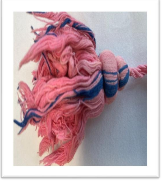
Image 15./16. Edge Cloth Foot Closure Stitching Skirt View and Waistband Tassel

It was observed that the shoulder, collar, and hood inner seams were flatlock stitches; upon examining the pocket pattern, it was found that a round cut was made at the bottom, and the pocket print (2mm) was closed with a fine print stitch. At the end of the hood of the bathrobe, which has tassels in pink and blue colors, it was determined that the tassel tying color is pink, and the twist was made with 9x2 = 18 threads twisted as 19+19.