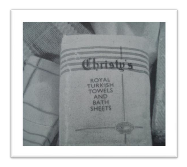
Image 4. Royal Turkish Towels Made in Christy's (http://www.turkishtowelsf4.com/brand.pdf)

showed great interest in towels bearing their own coat of arms throughout the exhibition. The Ottoman Empire, which participated in this first exhibition in 1851, was represented in the exhibition with a wide range of products in the textile industry, one of its leading sectors. Towels such as "futa," "peskir," and hand towels were prominent pieces in the exhibition (Önsoy, 1983: 196).