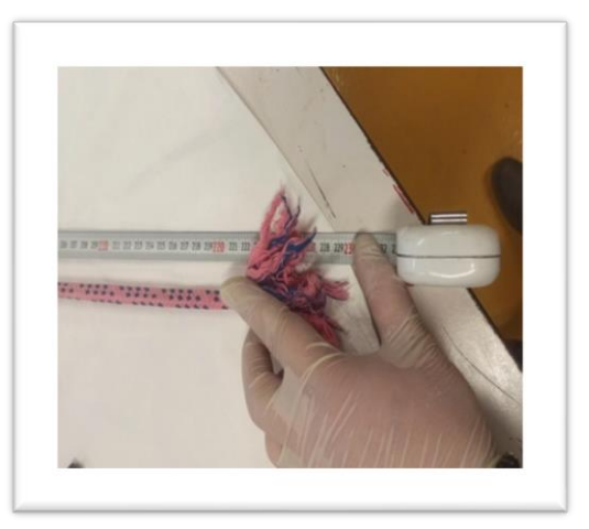
Image 17./18. Waist Cord Girdle Weight and Waist Cord Girdle All Sizes

Since the original robe is one size, the measurements are made accordingly.