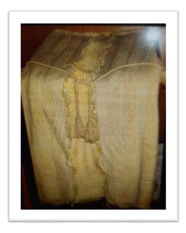
Image 5. Atatürk's Bathrobe at the Harbiye Military Museum in Istanbul

One of Atatürk's color preferences is blue, which is integrated with his deep and romantic personality and his eyes (Türkan, 2011: 184). Information from a memory attributed to Atatürk indicates that besides blue, which he referred to as a friendly color, he also liked white and beige colors. It is understood that he preferred red more often for sleepwear (Altıner, 1981: 412-413; Türkan, 2011: 184). A study on Atatürk's clothing reveals information about his bathrobe: This bathrobe, in good condition and located in the Istanbul Harbiye Military Museum (Image 5), is cream-colored, with tassels in the same color, made of thick striped towel fabric, featuring a V-neck, tied at the waist, and with straight sleeve attachments (Ataman, 2013: 187)