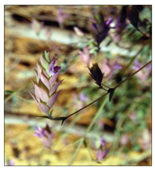
Figure 1: Origanum hypericifolium

Candida spp. are important healthcare-associated pathogens especially immunocomprimised host. Antifungal resistance, increasing costs, hospitalization time, and treatment difficulties of candidal infections are worldwide problems. Antifungal strategies are mainly based on targeting molecules on yeast cell wall, inhibition of cytochrome