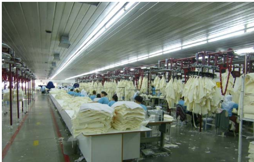
Figure 1. Preparation line (on the left) and assembly line with the overhead conveyer (on the right)

In apparel department of the company, one preparation line and an assembly line with an overhead conveyer is employed for bathrobe manufacture (Figure 1). The study focuses on the same operations but analyzes two different orders having distinct fabric color and properties, also distinct embroidery pattern and properties.