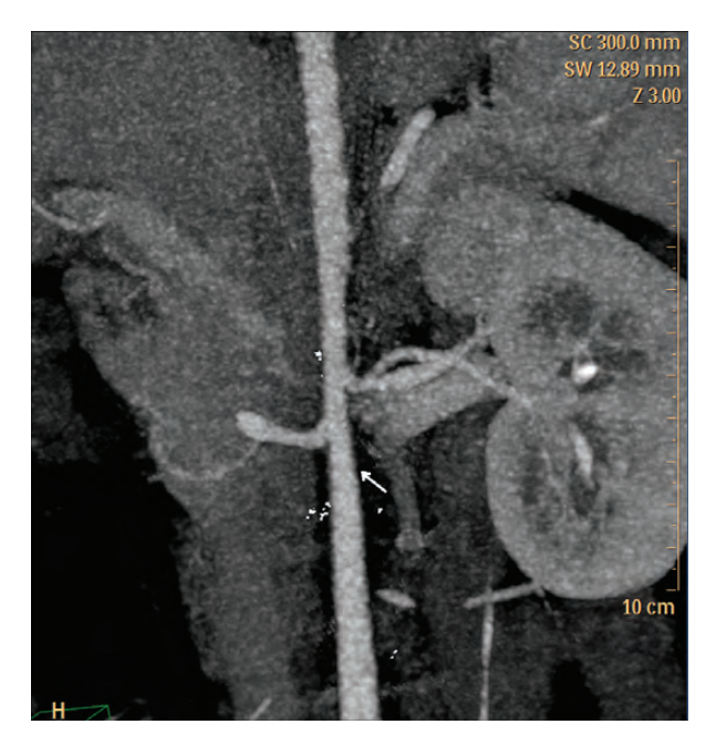
Fig. 2. Multiple projections reformatted maximum-intensity projection coronal image shows the stenotic segment of the mid-aorta which ends at 1 cm inferior to renal arteries (arrow).

aorta, which was covered with suprarenal, interrenal and infrarenal stents, gave rise to bilateral renal hypoperfusion. In renal hypoperfusion, angiotensin II increases efferent arteriolar resistance, which in turn increases capillary hydrostatic pressure, thereby maintaining the glomerular filtration rate despite decreased renal perfusion [1]. In our patient, a physiological adaptation effect of angiotensin II was completely blocked with ramipril and losartan, and therefore blood flow through the kidneys decreased, eventually leading to acute renal failure.