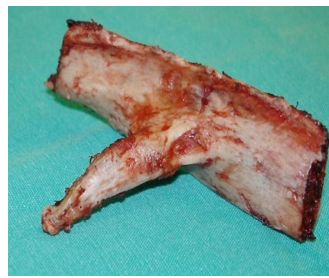
Figure 2. Exostosis appearance at the excised costal material.

It can damage the surrounding structure in long term. Progressing of the destructive processes can be prevented and curative treatment can be provided by early diagnosis in such cases.