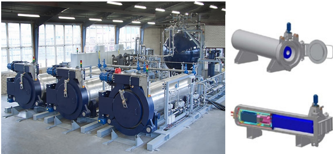
Figure 1. Commercial supercritical carbon dioxide beam dyeing machine developed by DyeCoo company [3]

Recently, for the first time, novel water-free fabric rope fabric dyeing machine in supercritical carbon dioxide fluid media was effectively designed, produced and built in a pilot scale plant (Figure 1) [3]. The results of the novel rope dyeing in supercritical carbon dioxide media were satisfactory and commercially acceptable with good wet-wash and rub color fastness levels (4 to 5 gray scale ratings) and color uniformity [2].