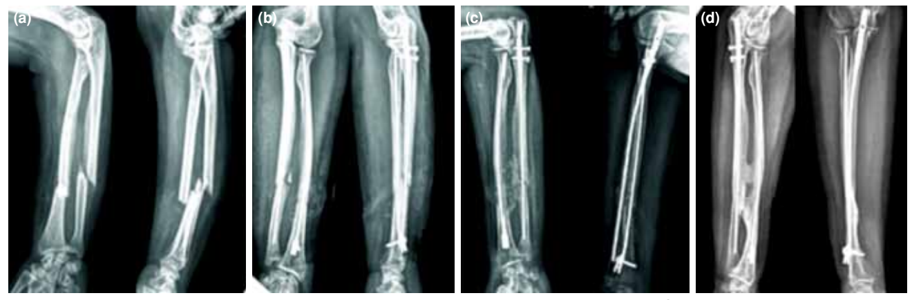
Figure 2. A 35-year-old male patient with both-bone forearm fracture Arbeitsgemeinschaft für Osteosynthesefragen type B3 fixed with closed forearm nailing resulted in union with synostosis; (a) preoperative radiogram, (b) postoperative first day radiogram, (c) postoperative second month radiogram, and (d) postoperative first year radiogram.

147.3±17.4% (129.5-164.4). A statistically significant relationship was observed between radial bowing change and nonunion (p=0.01). No relationship was found among radial bowing change and range of motion such as pronation and supination and level of satisfaction. A relationship between radial bowing with grip and pinch forces has been observed. A significant relationship among MHOQ and DASH-T questionnaire scores with radial bowing change was found (Table I). According to the Grace-Eversmann scoring system, 30.4% poor results, 4.3% good results, and 65.2% perfect results were obtained.