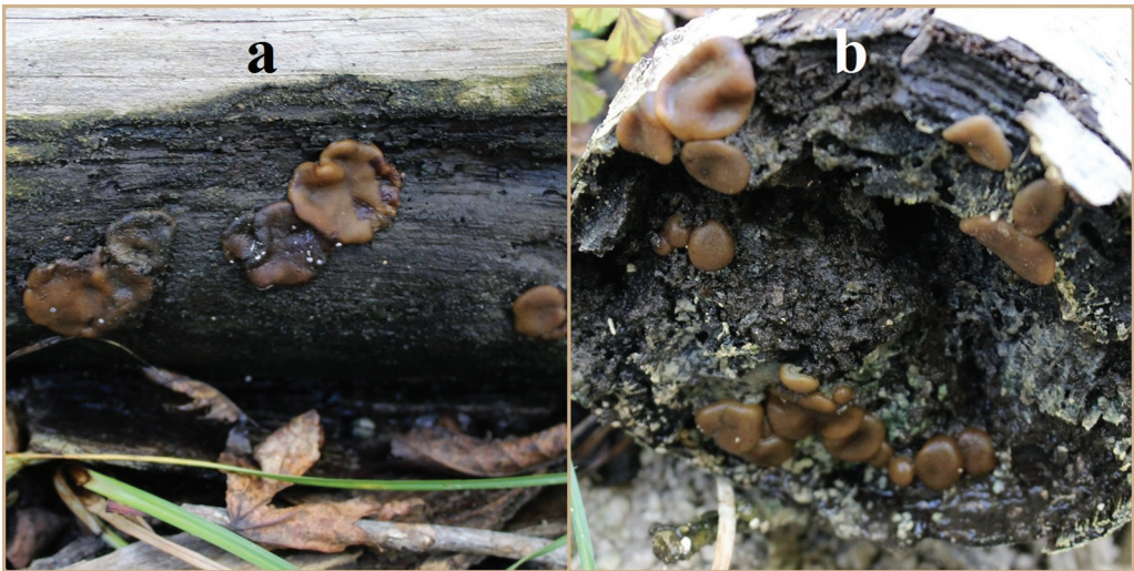
Fig. 1. P. nummularia : a and b – fresh ascomata developed on wood of L. orientalis .

Ascomata 1–2 cm in diameter, sessile, disc shaped, initially flat but with undulating surface or somewhat convoluted as it get age, hymenium smooth and shiny when wet, from chestnut to greenish-light brown, becomes blackish with time, outer surface lighter, almost whitish beige and often invisible. Asci 340–425 × 19–22 µm, cylindrical, operculate, non-amyloid, with