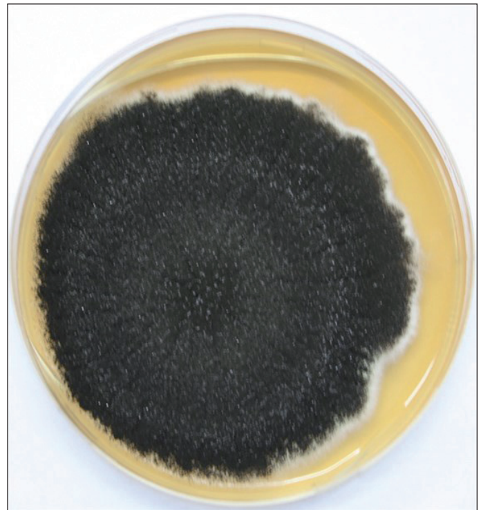
Figure 2: Appearance of standard plate culture after two days of inoculation with the same sample.